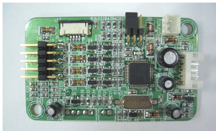
Figure : Photo of controller board: