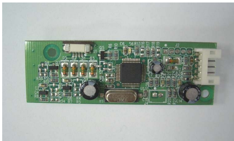
Figure : Photo of controller board: