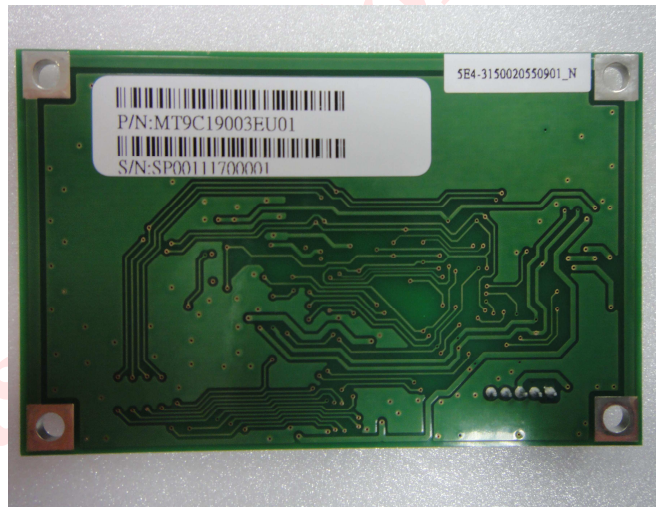
控制器 Barcode label 正面照片(Front view of barcode label)