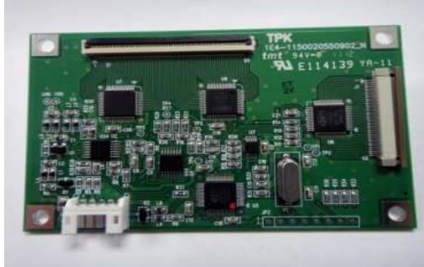
控制器成品背面照片(Bottom view of control board)