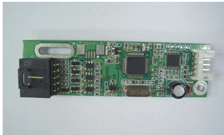
Figure : Photo of controller board: